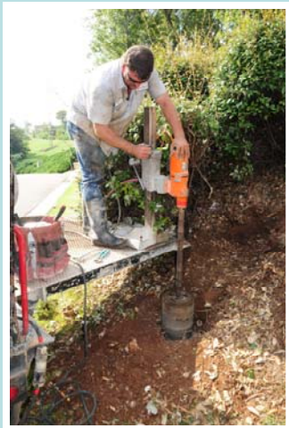
Drilling the hole for the pole through the solid rock was a difficult task