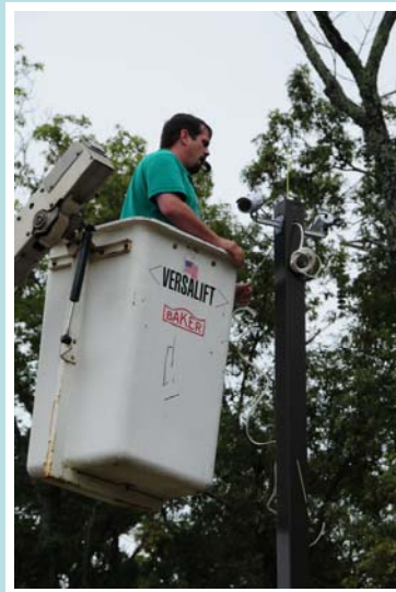
A technician installs and adjusts the 4 cameras

Our video system is a state-of-the-art system of 4 fixed cameras and a very capable DVR. All cars are recorded both coming and going. In fact, anything that moves on the roadway and sidewalks is recorded. In both the uphill and downhill directions, two cameras are watching...one is a standard color camera with Infrared night vision. The other is a license plate camera that sees only licenses, day or night in any weather. Any time motion is detected, all 4 cameras are recorded. About 3 months of video can be recorded before the disk overwrites. The system is controlled via Internet by WMHA. The system has alarms on it to deter tampering. It has been running for about 2 weeks and operates 24/7.