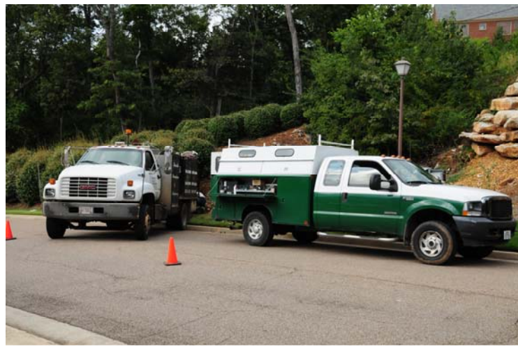
Installation took about a week with vehicles restricting our only way in or out